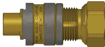
N-Series Bowes Interchange Safety-Lock Nipple