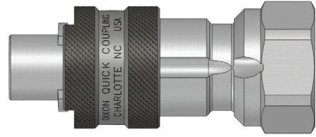
N-Series Bowes Interchange Nipple