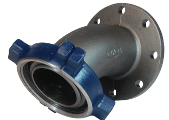
male adaptor x 45° flange with hammer union nut