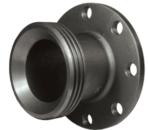
female adaptor x flange