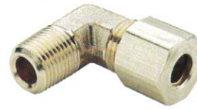
Male Elbow 169C-269C Reference SAE 060202 BA