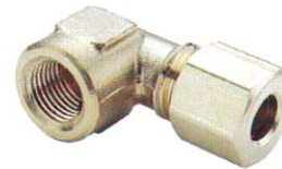
Female Elbow 170C Reference SAE 060203 BA