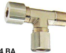
Male Run Tee 171C Reference SAE 060424 BA