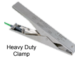
Heavy Duty Clamp