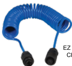
EZ Spiral Clamp